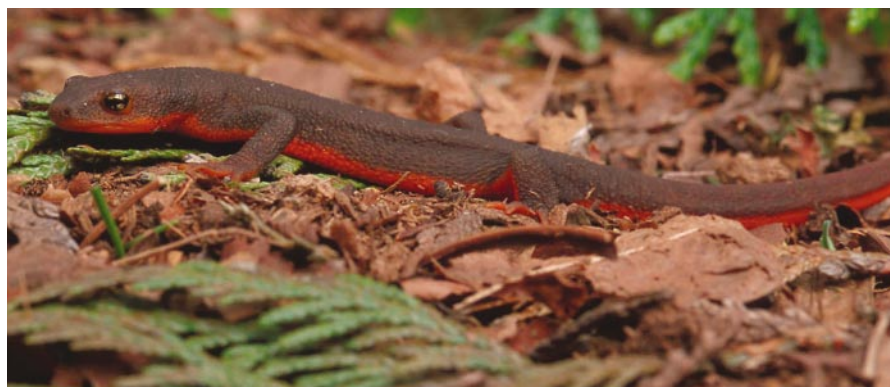
The Oregon newt is at the centre of a current study to evaluate Bateman's principle in the wild.

But if the layers of behavioural complexity are removed, how well does Bateman's basic theory about the relative benefits of promiscuity for the two sexes hold up? To